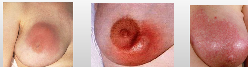
Examples of Breast Abscess Presentation

NB - Allergy to Penicillin, replace with alternative e.g Erythromycin